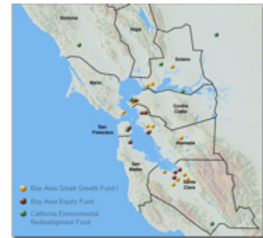
Family of Funds Investments

The strong success of the "Bay Area Family of Funds," which are literally changing the lives of residents throughout the region, continues with a new $41 million infusion. The Bay Area Council created the Family of Funds to bring private investment into the region's economically-challenged neighborhoods to promote smart growth, address poverty, support local businesses and clean up contaminated sites. The Funds – now a national model – harness double bottom line returns: market rates of financial return to the investors (the first bottom line) and significant economic, social, and environmental returns to reduce poverty and promote smart growth (the second bottom line).