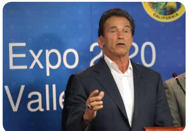
Governor Schwarzenegger announces Silicon Valley, USA bid