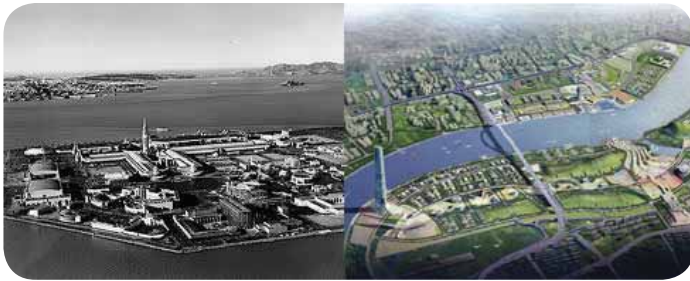
Treasure Island - 1939 | Shanghai - 2010

A World Expo is an international event now held every five years in different parts of the world, with a history dating back to the Great Exhibition in London in 1851. The first World Expo in 1851 also created the first America's Cup Race, currently scheduled for 2013 on San Francisco Bay. Hundreds of exhibitors participate in a World Expo; countries are most prominent, but an Expo can also include international organizations, corporations and other groups. Since its formation in 1928, the Bureau of International Expositions (BIE) has been the governing body responsible for overseeing the bidding and selection process for these Expositions, of which there are two main types: