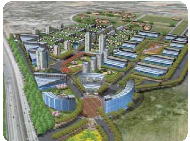
Planned Academic Center