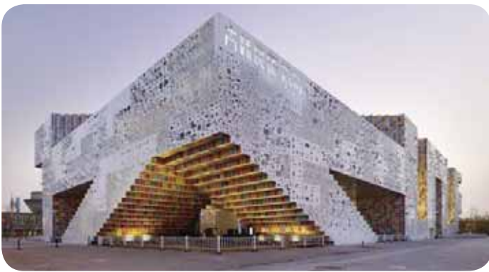
Korean National Pavilion, Shanghai - 2010