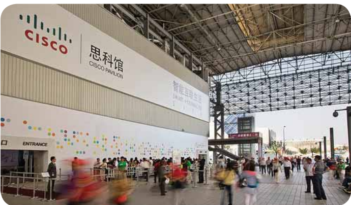
Cisco Corporate Pavilion, Shanghai - 2010