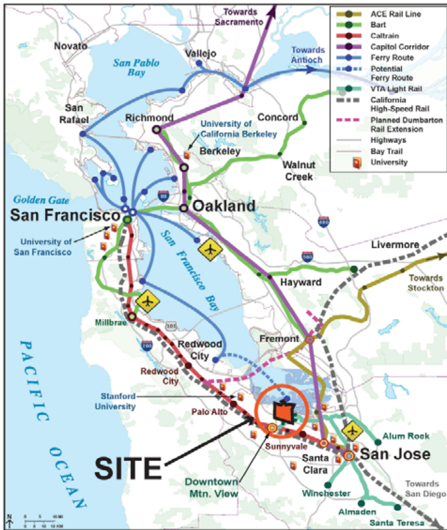
Public transit service to proposed 2020 site

VTA. The Santa Clara Valley Transportation Authority's light rail system (VTA) would have to handle an increased volume of passengers. To provide an optimum level of service, whether from downtown San Jose or from the Caltrain station in Mountain View, some expansion of VTA's system would be necessary. VTA's capacity to serve Moffett Field is constrained. At present, it only has the capacity to move approximately 3,200 people a day along the 44-minute route from downtown San Jose to Moffett Field. Given forecasts of attendance at a World Expo, this is approximately 2% of the projected daily visitor totals.