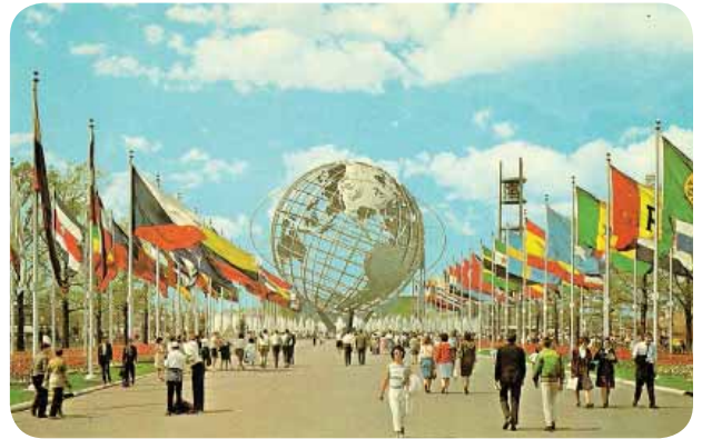
New York - 1964

Estimates of the expenditures related to previous World Expos indicate that hundreds of millions of dollars are spent in the local economy by various participants. Exhibitors will generally take up residence in the area well in advance of the event in order to prepare their displays, which take the form of pavilions – immersive exhibition