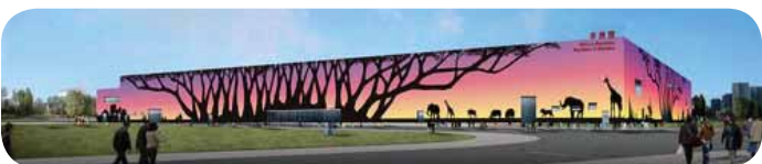
Joint African Pavilion, Shanghai - 2010