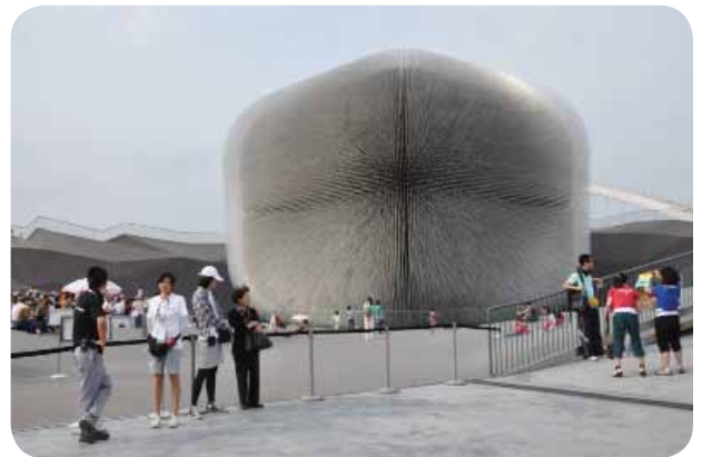
UK Pavilion, Shanghai - 2010